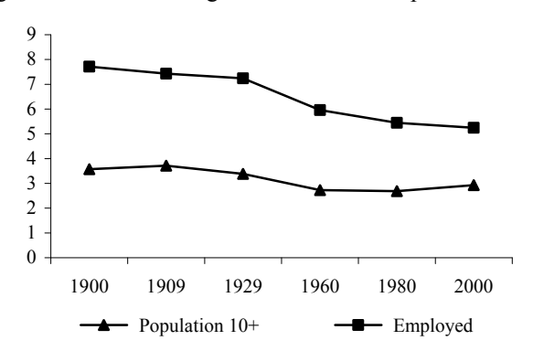
Figure 2. Mean time of gainful work in Europe in hours daily